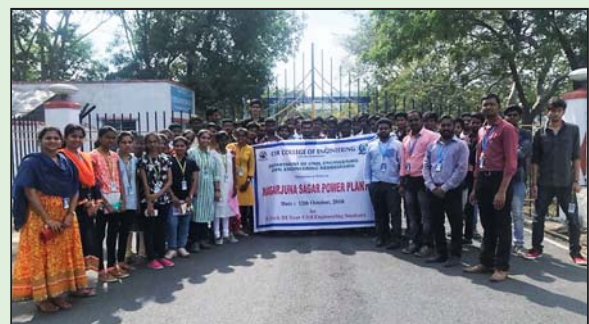
Visit to Nagarjuna Sagar Power Plant

The Civil Engineering Association organized a visit to Nagarjuna Sagar Power House & Dam on 12 October, 2018 for the B.Tech III Year Civil Engineering students. The visit gave the students an idea about the on-site working of power houses. This helps the students in co relating the theoretical concepts of fluid mechanics and hydraulic machinery with the actual working elements in a power house.