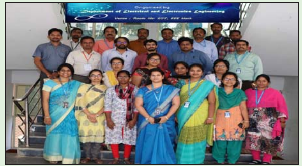
Participants in FDP