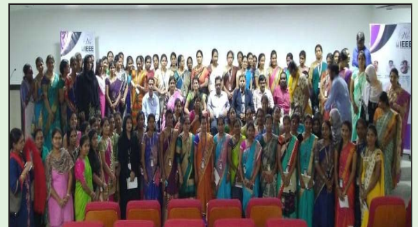
Workshop at Vaagdevi Engineering College