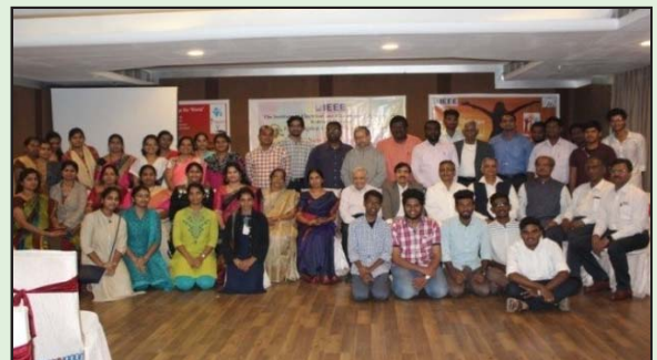
Participants at the Flagship Event