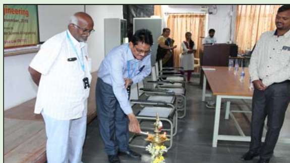
Inaugural Function of the Workshop