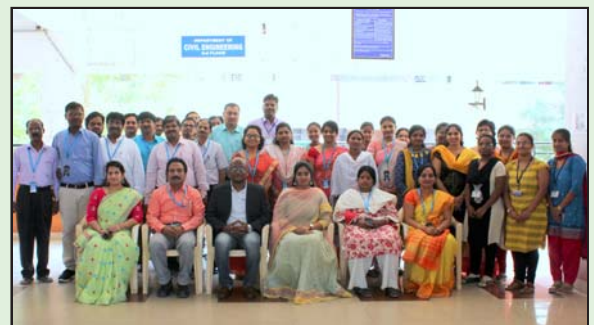
Participants in the Conference