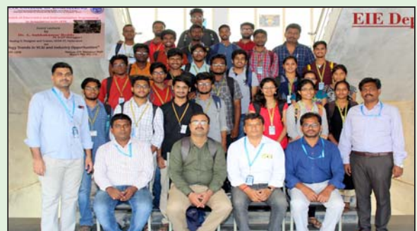
Participants at the Guest Lecture