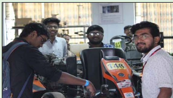
Students Participating in the Fest