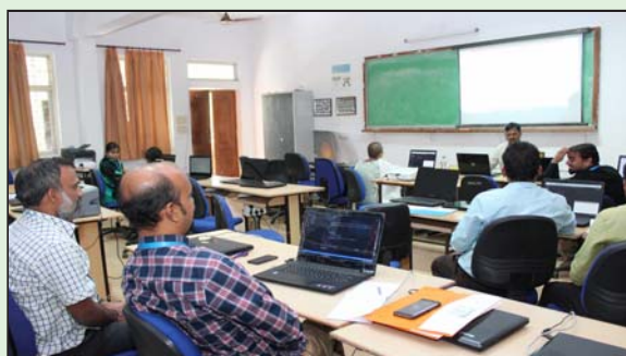
Workshop in Progress