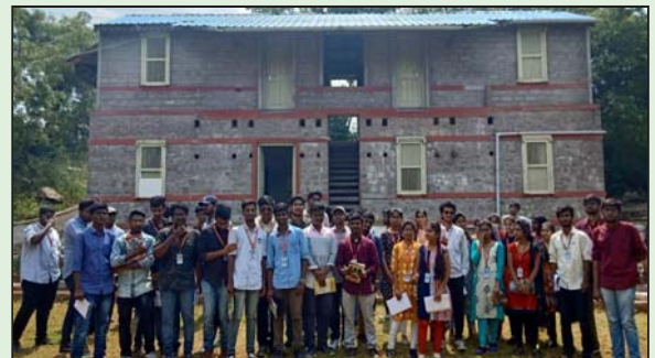
Visit to NIRD

The Civil Engineering Association organized a visit to the National Institute of Rural Development (NIRD) for the B. Tech II Year Civil Engineering students on 5 & 6 October, 2018. The visit provided the students with insights on the key issues involved in planning and development of villages and applications of civil engineering in development of rural areas.